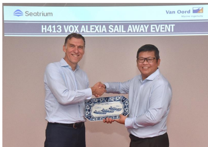
Marking the successful partnership between Seatrium and Van Oord during Vox Alexia's sailaway event