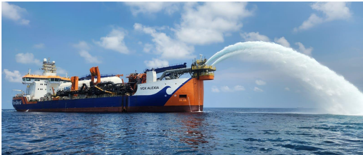
Successful delivery of Vox Alexia, the third dual-fuel LNG-powered trailing suction hopper dredger built by Seatrium for Van Oord

“We have developed strong synergy with the Van Oord team through this series of vessels and we look forward to continuing this close partnership in the new and renewable energy space.”