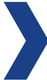
Global Fossil Fuel Consumption 1

Persistent under-investment in O&G infrastructure historically